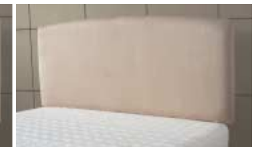
Monaco headboard in Natural Suede finish.