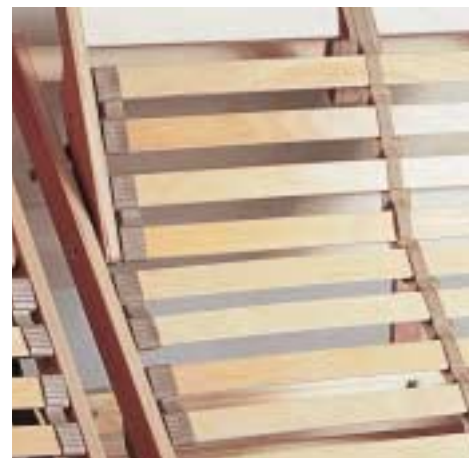
Drawer options not available on adjustables. Available with both 'firm' and 'regular' Postureform mattresses