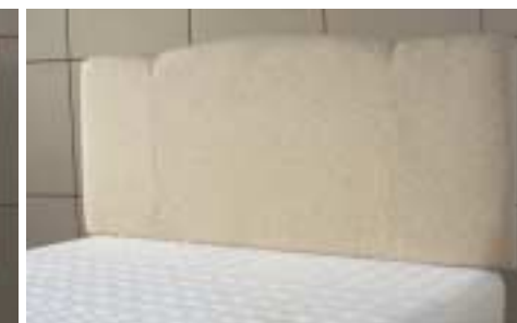
Trio headboard in Beige Bouclé finish.