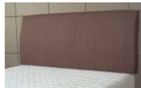
Neptune headboard in Chocolate Suede finish.

The headboard collection features three stylish designs which are available in the following widths: 75cm, 90cm, 105cm, 120cm, 135cm, 150cm and 180cm. Each headboard is available at additional cost in a choice of two fabric options, Suede (in Chocolate or Natural) or Bouclé (in Beige only).