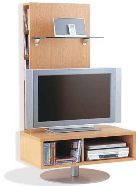
8190 Swivel TV Unit complete with DVD/CD storage to rear, Oak