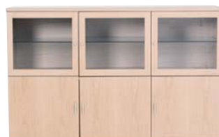
8580 Display Sideboard L165 (65") x D47 (18 1 / 2 ") x H104 (41")