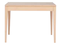
1560 Compact Table L100 (39 1/2") x W90 (35 1/2") x H75.5 (29 3/4") Extended L150 (59")