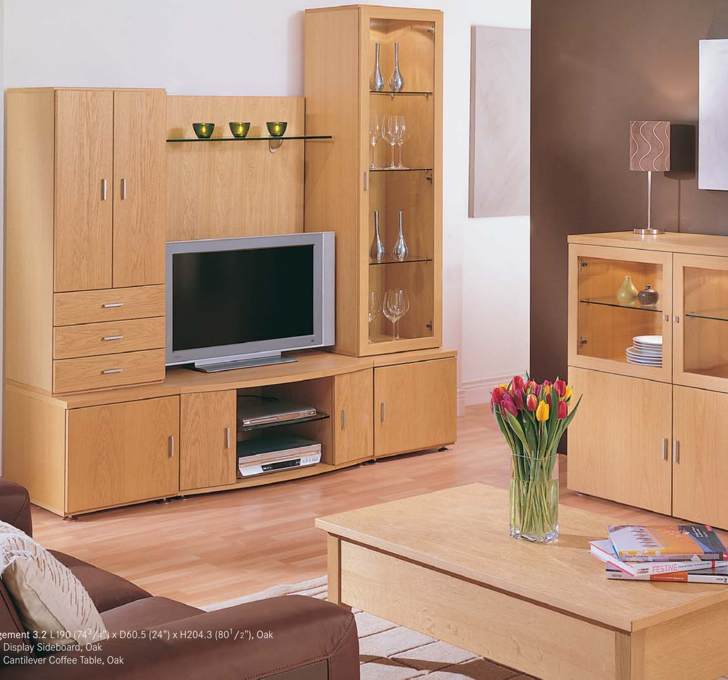
Arrangement 3.2 L190 (74 3 / 4 " ) x D60.5 (24" ) x H204.3 (80 1 / 2 " ), Oak 8580 Display Sideboard, Oak 1420 Cantilever Coffee Table, Oak