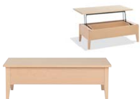
1420 Cantilever Coffee Table L117.5 (46 1 / 4 ") x W61.6 (24 1 / 4 ") x H39 (15 1 / 2 ")