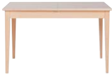
8660W Small Extending Table L125 (49 1/4") x W94 (37") x H76.5 (30") Extended L170 (67") 8650W Large Extending Table L168 (66 1/4") x W94 (37") x H76.5 (30") Extended L213.2 (84")