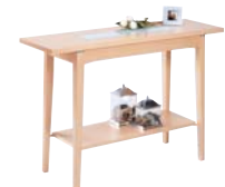
8610 Console Table L114 (45") x D36 (14 1 / 4 ") x H75 (29 1 / 2 ")