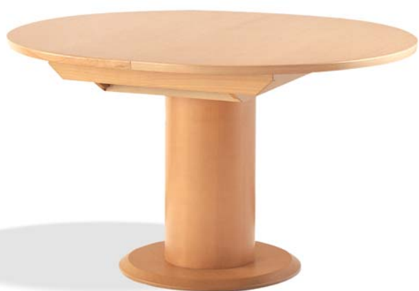
1540 Circular Dining Table, Beech