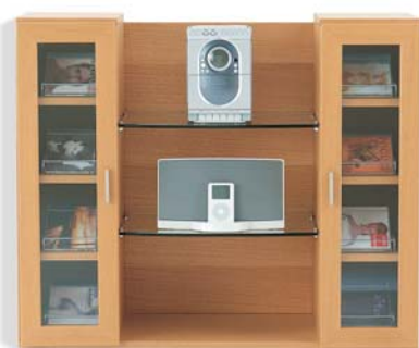
8280 Wide open Hi-Fi Unit with bowed glass shelves, Oak