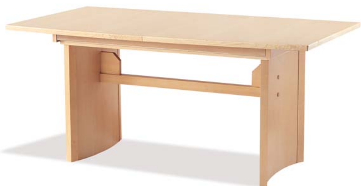
1510 Large Extending Dining Table, Maple

Words alone cannot convey the appeal of these superb tables and chairs. Why not visit your local stockist for a personal consultation to create a look that's unique to your home. Your local Connexions stockist will also have an up to date selection of the fabric options available on dining chairs.