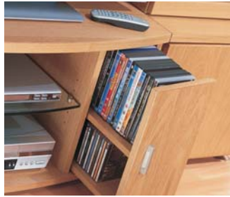
8150 Internal Storage