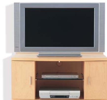
8150 Bowed TV/Video/DVD unit, Maple