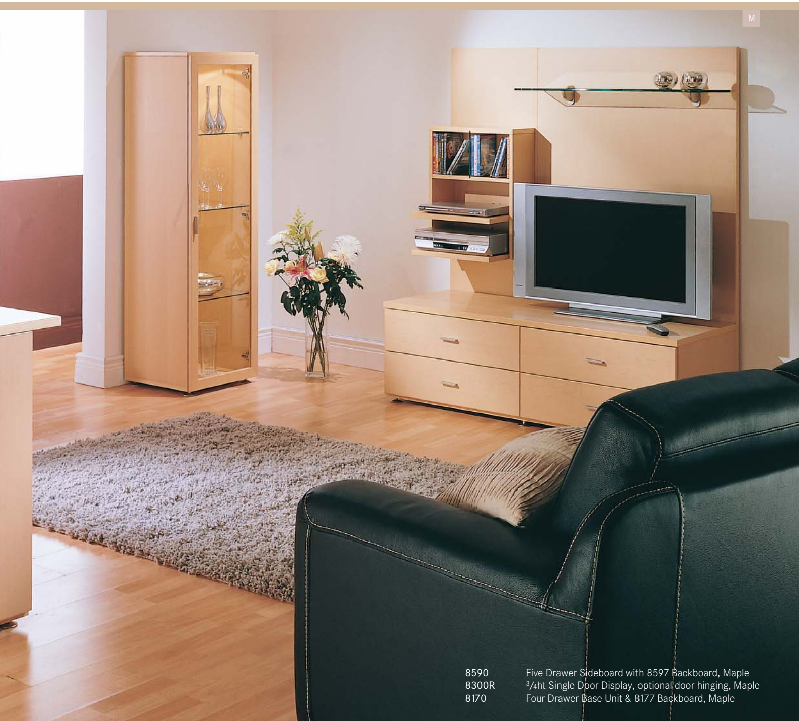
8590 Five Drawer Sideboard with 8597 Backboard, Maple 8300R \frac{3}{4} ht Single Door Display, optional door hinging, Maple 8170 Four Drawer Base Unit & 8177 Backboard, Maple