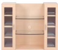
8280 Wide Open HiFi Unit Ext. L95 (37 1 / 2 ") x D43.5 (17 1 / 4 ") x H81.5 (32 1 / 4 ") Int. L47 (18 1 / 2 ") x D39.5 (15 1 / 2 ")