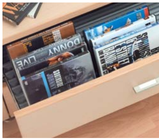
8170 Four Drawer Base Unit