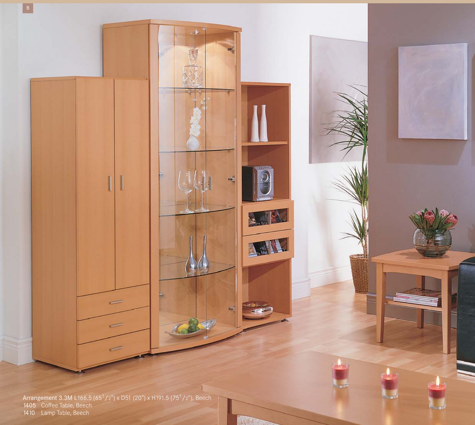
Arrangement 3.3M L166.5 (65 1 / 2 " ) x D51 (20" ) x H191.5 (75 1 / 2 " ), Beech 1405 Coffee Table, Beech 1410 Lamp Table, Beech