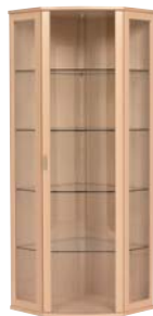
8500 Corner Display Unit L65 (25 1 / 4 ") x D71 (28") x H191.5 (75 1 / 2 ") (M) Mirrored back available