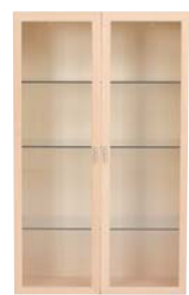
8400 3/4 ht Double Door Display No Glass Sides L95 (37 1 / 2 ") x D43.5 (17 1 / 4 ") x H158.5 (62 1 / 2 ")