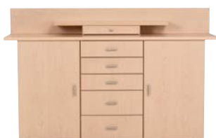
8590 Five Drawer Sideboard L162.5 (64") x D47 (18 1 / 2 ") x H84 (33") 8597 Backboard Ex 8590 L162.5 (64") x D23.5 (9 1 / 4 ") x H21 (8 1 / 4 ")