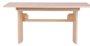
1510 Large Extending Dining Table L170 (67") x W95 (37 1/2") x H77 (30 1/2") Extended 1 L216.5 (85 1/4") Extended 2 L263 (103 1/2")