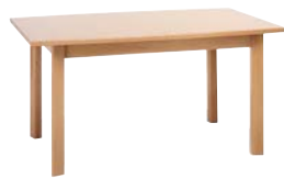
1520 Flip Centre Dining Table L151 (59 1/2") x W90 (35 1/2") x H76 (30") Extended L196 (77 1/4")