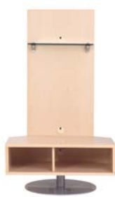
8190 Swivel TV Unit L90 (35 1 / 2 ") x D73.5 (29") x H154 (60 3 / 4 ") TV Section D57 (22 1 / 2 ") DVD/Video Section LHS L35.5 (14") RHS L47 (18 1 / 2 ")