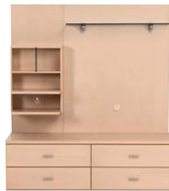
8177 Backboard (& 8170 Base Unit) L142.5 (56 1 / 4 ") x D56.5 (22 1 / 4 ") x H161 (63 1 / 2 ") TV Section L95 (37 1 / 2 ") x D53.5 (21") DVD/Video Section L42 (16 1 / 2 ") x D35.5 (14") H15 (6") each section (see 8170 for measurements)