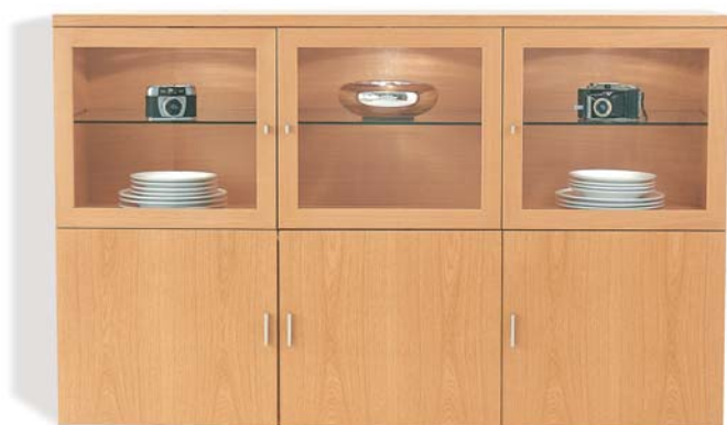
8580 Display Sideboard, Oak

For optimal convenience, there is a choice of sideboards, ranging from the sleek lines of the 8590 five drawer unit, to the elegant three door 8580 unit, with internal lowlighting.