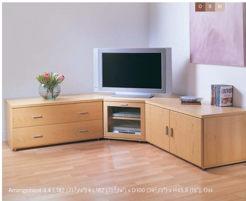
Arrangement 3.4 L182 (71 3 / 4 " ) x L182 (71 3 / 4 " ) x D100 (39 1 / 2 " ) x H45.8 (18"), Oak