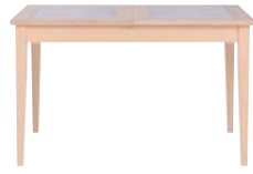
8660G Small Extending Glass Top Table L125 (49 1/4") x W94 (37") x H76.5 (30") Extended L170 (67") 8650G Large Extending Glass Top Table L168 (66 1/4") x W94 (37") x H76.5 (30") Extended L213.2 (84")