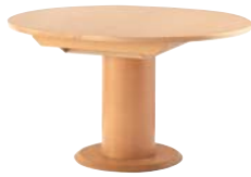
1540 Circular Dining Table L135 (53") x W118 (46 1/2") x H78.5 (31") Extended L174 (68 1/2")