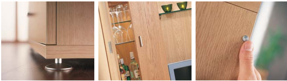
Soft Touch Lighting