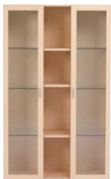
8410 3/4 ht Double Display with Shelving L95 (37 1 / 2 ") x D43.5 (17 1 / 4 ") x H158.5 (62 1 / 2 ")